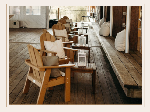
TABLE TOP LANTERNS Black Quantity: 6 White Quantity: 6 Large White Quantity: 3